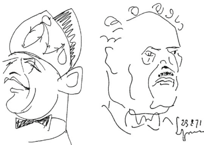
Fig. 11.2 Papy and Freudenthal (caricatures by Léon Jesmanowicz, 1971)