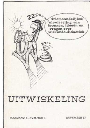
Fig. 11.3 Cover Uitwisseling , November 1987 (design: Abdon Van Bogaert)