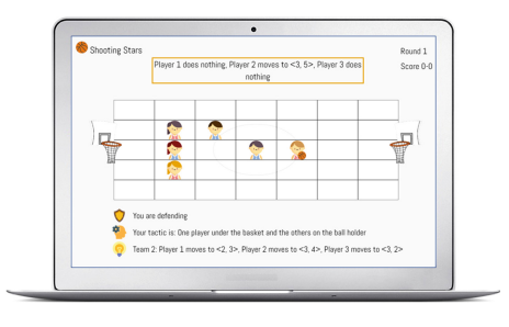
Fig. 1. Snapshot of the EduBAI UI

The Event Calculus [4,6] is a narrative-based many-sorted first-order