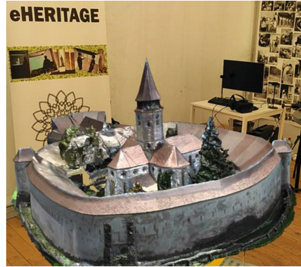
Fig. 2. Screenshot from the Lenovo device