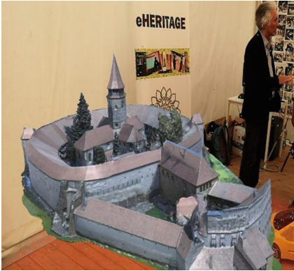
Fig. 1. Screenshot from the Huawei device