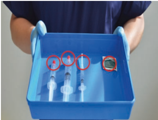
Fig. 11.2 General Aseptic Field with Micro Critical Aseptic Fields