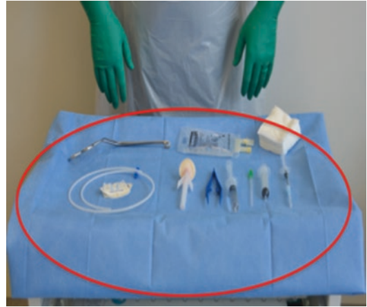
Fig. 11.1 Critical Aseptic Field (used with permission The Association for Safe Aseptic Practice – ASAP)

Critical Aseptic Field —Usually a sterilized drape, used when a single main aseptic field is required to house and protect all procedure equipment that is typically removed from individual packaging onto the field. A main Critical Aseptic Field is used to help ensure equipment is maintained in an aseptic state during procedures by providing essential and primary protection from the procedure environment. Critical Aseptic Fields require what can be termed ‘critical management’