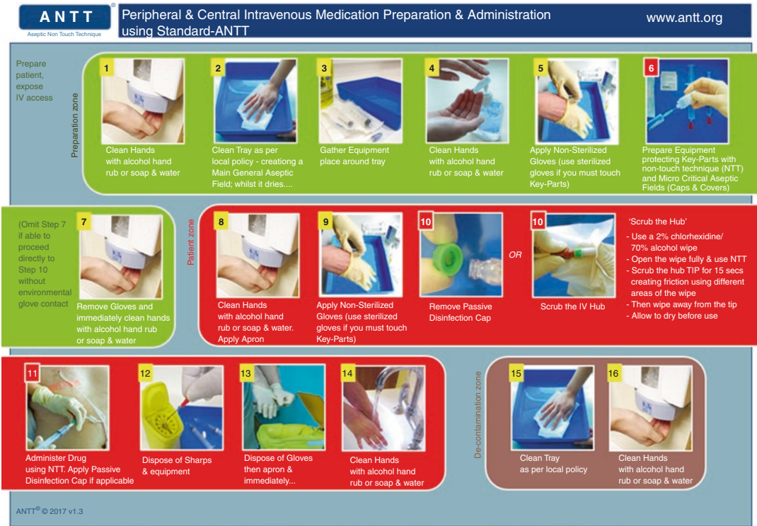
Fig. 11.4 ANTT® procedure guidelines (used with permission The Association for Safe Aseptic Practice – ASAP)