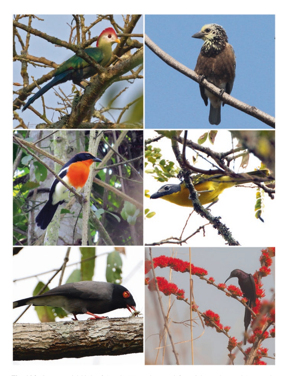
Fig. 14.2 Some special birds of Angola. Top to bottom, left to right: Red-crested Turaco, the endemic national bird of Angola. (Photo: Lars Petersson); Anchieta's Barbet, a sought-after species with a range extending to the DRC and Zambia but best seen in Angola. (Photo: Maans Booysen); Braun's Bushshrike, an endemic restricted to the forests of the northern escarpment. (Photo: Fiona Tweedie); Monteiro's Bushshrike, a difficult-to-see endemic associated primarily with the central escarpment. (Photo: Tasso Leventis); Gabela Helmetshrike, an endemic that occurs primarily at the base of the central escarpment, as in Quiçama NP. (Photo: Tasso Leventis); Bocage's Sunbird is only present in the highlands of Angola and the southwest of the DRC. (Photo: Alexandre Vaz)