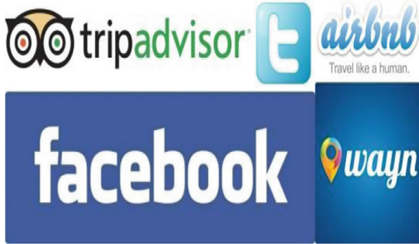
Fig. 2. Five best social network sites used in travel and tourism [15]

WAYN, Airbnb.com and TripAdvisor. Ali and Frew [11] list among the most popular travel-related SNSs WAYN, Couchsurfing, Travelbuddy and Travellerspoint. Figure 2 below illustrates the five best network sites used in travel and tourism.