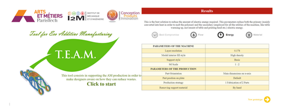
Fig. 3. Welcome page and results pages with Axure

become complicated. For these reasons the Axure version has been selected as the best one for performing trials with users.