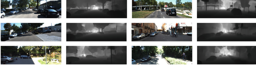
Fig. 4. More qualitative results on KITTI test splits.

focus on modeling the highly non-linear residuals while direct learning needs to predict absolute depth values. Moreover, residual learning also helps alleviate the problem of over-fitting [13].