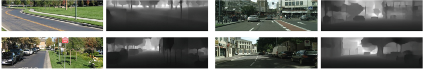
Fig. 5. Qualitative results on Make3D dataset [24] (left two columns) and Cityscape dataset [4] (right two columns).

ponent into our model. The results are shown in Table 2. Besides the improvements brought by residual learning and vertical pooling modules which have been analyzed in the above comparisons, integrating affinity layer can result in major improvements on all the metrics. This proves that affinity layer is the key component of our proposed approach and thus well validate the insight that explicitly considering relative features between neighboring patches can help the monocular depth estimation. Moreover, integrating fully connected layers to exploit global context information further boosts the performance of our model. It can be seen from the last row of Table 2 that accuracy at \delta < 1.25^3 is further improved to 0.984. This shows that some challenge outliers can be predicted more accurately given the global context information.