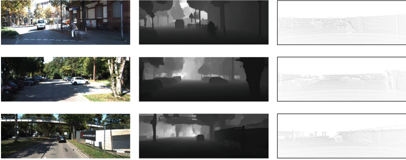
Fig. 2. Examples of the enhanced dense depth maps generated by a stereo matching model [22]. We use these depth maps as complementary data to the sparse ground truth depth maps. The left column contains RGB images, while the middle and right column show the enhanced depth maps and sparse ground truth, respectively.

indicates the global layout and properties of the image. The global features of the fully-connected layer, the absolute features from the deep encoder, and the relative features are fed into our depth estimator, a multi-layer CNN, to generate an initial coarse estimate of the image depth. In the meanwhile, we also take these features as initial input of the following multi-scale refinement modules. The refinement network at each scale is composed of a proposed vertical pooling layer which aggregates local depth information vertically, and a residual estimator which learns residual map for refining the coarse depth estimation from the last scale. Both the features from previous scale and the proposed vertical pooling layer are used in the residual estimator.