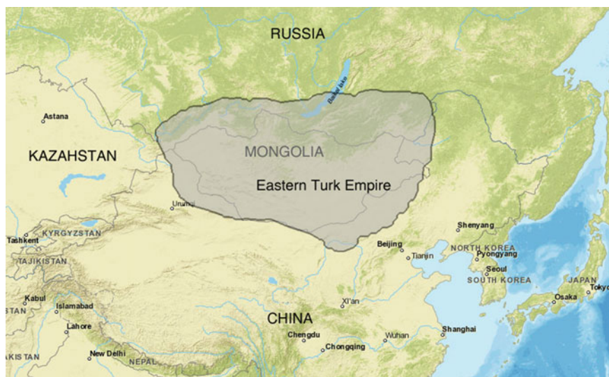
Fig. 8.1 Map of the Eastern Turk Empire

Researchers divide the history of the Turk Empire into several periods (Sinor 1990b; Barfield 1992; Gumilev 1967; Klyashtorny 1964; Beckwith 2009). The first (AD 534–630) is characterized by the appearance of the Turks on the Chinese border and the beginning of intensive Turkic-Chinese trade relations accompanied by a gradual strengthening and broadening of the spheres of influence of the nomadic state. In the second period (AD 630–679) the independent state of the Turks was non-existent anymore. The main reason for the defeat of the Turks is considered to be the military campaign undertaken by Emperor Taizong in AD 630 which was later followed by his active policy in strengthening China in AD 630–649. The consequence of this was that the Turks were no longer a serious military or political threat until the year