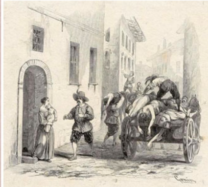
Fig. 1 (continued)