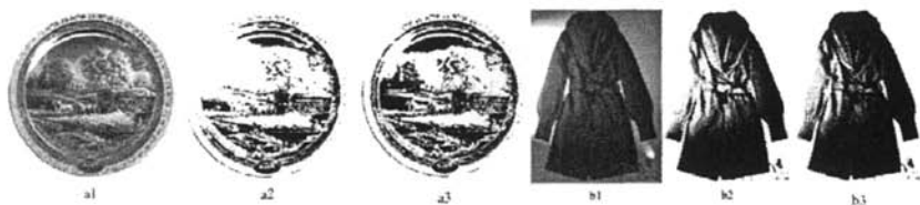
Figure 4. Comparative Results

There are two methods to extract the image features. One is to extract after filtering the luminance information, the other is not. We compare the two methods.