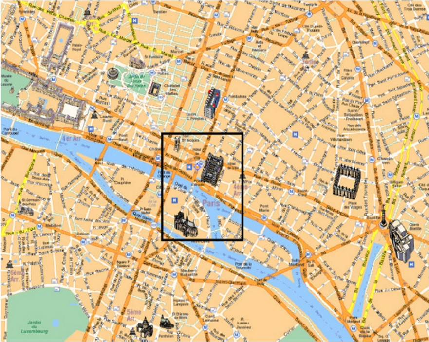
Figure 1 Comparison between the size of a typical 240x320 PDA screen (the area highlighted by the black rectangle) and a common 1280x1024 desktop screen (the whole picture).

The recent availability of mobile devices with increasingly powerful graphics capabilities is making it possible to develop novel visual interfaces, based on interactive 2D (or even 3D) graphics, to help users on the move in dealing more quickly and easily with larger amounts of information. Limited cognitive resources and safety of mobile users are an additional motivation to employ mobile graphics effectively as a way to provide information at-a-glance that is easily understood with less cognitive resources and distracts the user as less as possible from her surrounding environment.