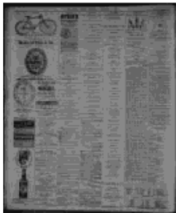
Fig. 1. One image of microfilm (T=115)

Acknowledgements. This project is supported in part by the Agency for Science, Technology and Research (A*STAR) and Ministry of Education, Singapore under grant R-252-000-071-112/303. We thank National Library Board, Singapore, for permission to use their microfilm images.