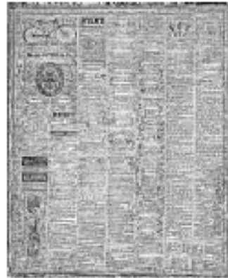
Fig. 4. Result of thresholding image of Fig 1 using Niblack method after histogram transformation