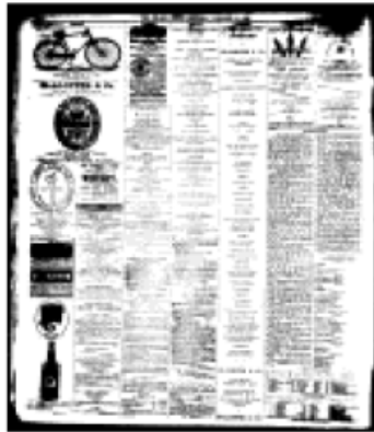
Fig. 3. Result of thresholding image of Fig 1 using Otsu method after