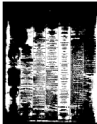
Fig. 2. Result of thresholding image of Fig. 1