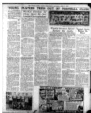
Fig. 7. Skewed newspaper microfilm image