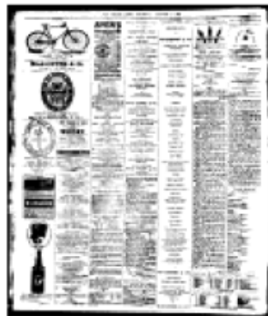
Fig. 5. Result of thresholding image of Fig 1 using our method after histogram transformation