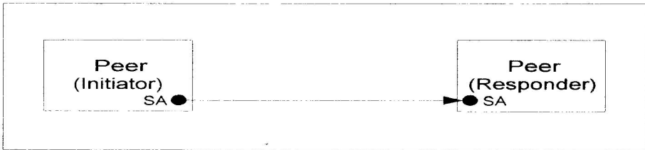
Figure 2. A Security Association (SA) between two entities

recommend the use of ISAKMP as a single key management framework for new uses such as group key management, as well as transport and application key management [RFC2408]. New uses can be realized through the specification of a DOI.