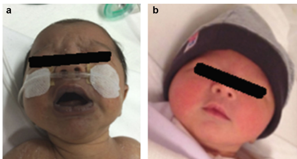
Fig. 1 a 12-day-old boy with a methemoglobinemia of 49.8 %. Of note is his dark, brown skin color, with dark brown lips. b The same boy directly after treatment with intravenous methylene blue

Young infants are more susceptible to developing methemoglobinemia because fetal hemoglobin is more easily oxidized than adult-type hemoglobin. Besides,