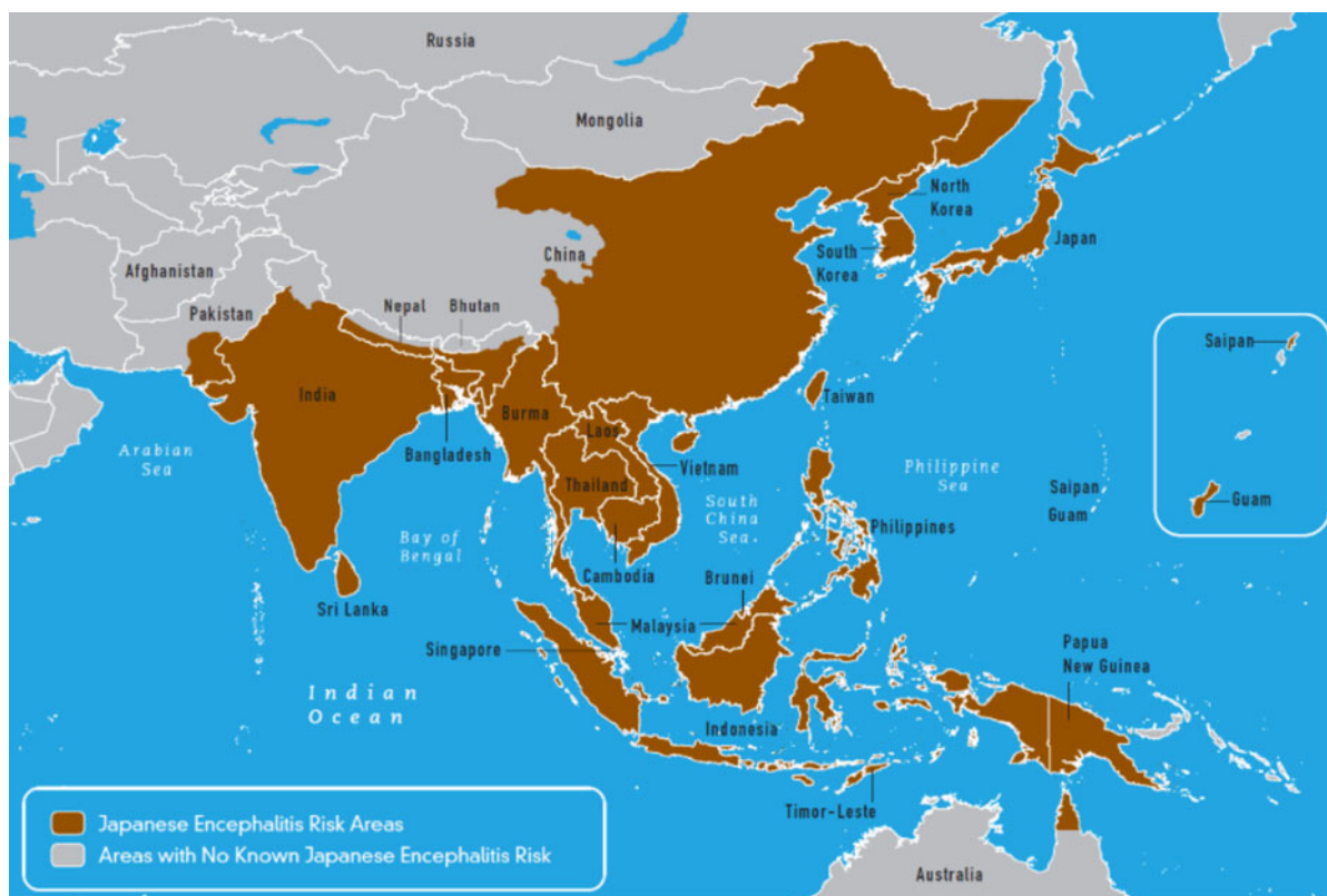
Fig. 1 Global geographical distribution of Japanese encephalitis.

countries have no pre-existing immunity and are at risk of acquiring a potentially devastating neurological infection with permanent sequelae. The need for vaccination must be weighed up against the duration of travel and the nature of activities undertaken.