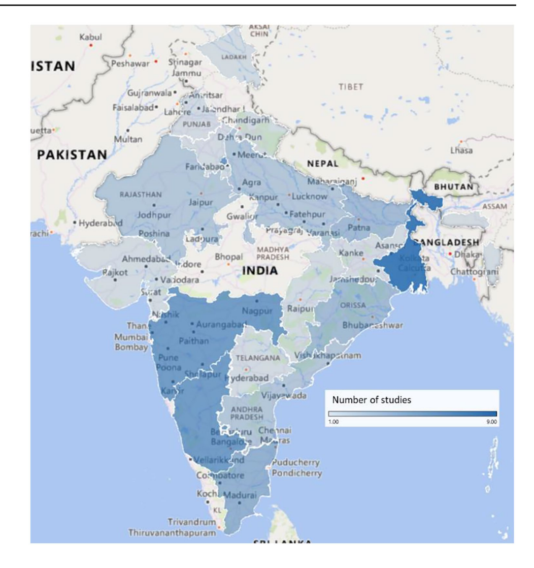
Fig. 2 Distribution of studies exploring food insecurity in India