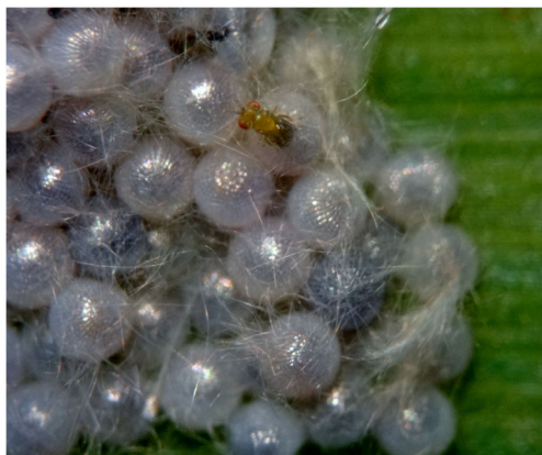
Fig. 1 Female of Trichogramma pretiosum parasitizing egg mass of Spodoptera frugiperda at maize leaf

Insects captured in pheromone traps have been used as a tool in IPM decision-making and to initiate chemical control