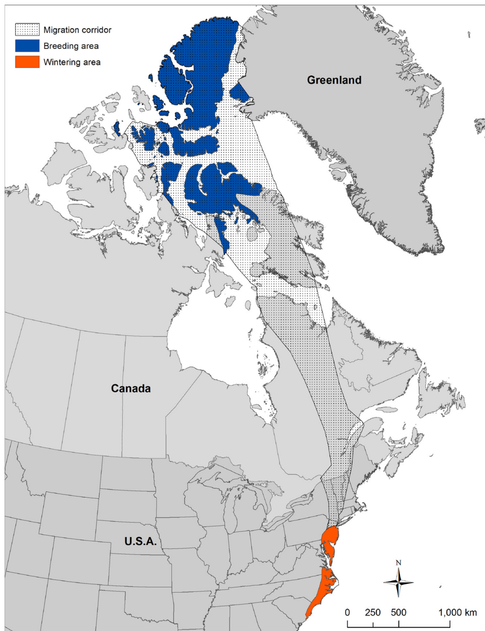
Fig. 1 Range map of greater snow geese in North America

major challenges encountered and lessons learned throughout the entire process.