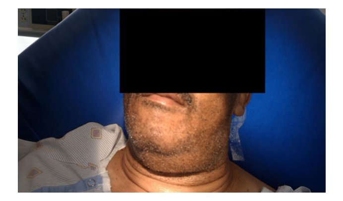
Fig. 1 67-year-old male with swelling in the submandibular region diagnosed as sialolithiasis by point-of-care ultrasound