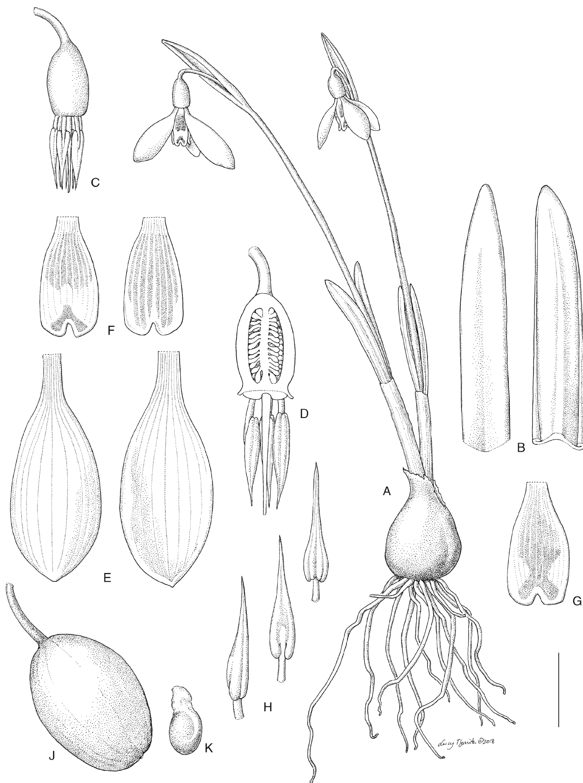
Fig. 1. Galanthus bursanus . A habit; B leaf (adaxial view (left) and adaxial view (right)), as cut from basal sheath; C flower with segments removed; D flower with segments removed in L.S.; E outer perianth segment (abaxial view (left) and adaxial view (right)); F inner perianth segment (abaxial view (left) and adaxial view (right)); G inner perianth segment (abaxial view), showing X-shaped marked variant; H anthers, showing side, abaxial and adaxial views (from lower to upper); J fruit (capsule) (including ovary); K seed. Scale bar: A = 2 cm; B, C = 7 mm; D – G = 8 mm; H = 4 mm; J, K = 1 cm. All from Zubov & Konca s.n. DRAWN BY LUCY T. SMITH.