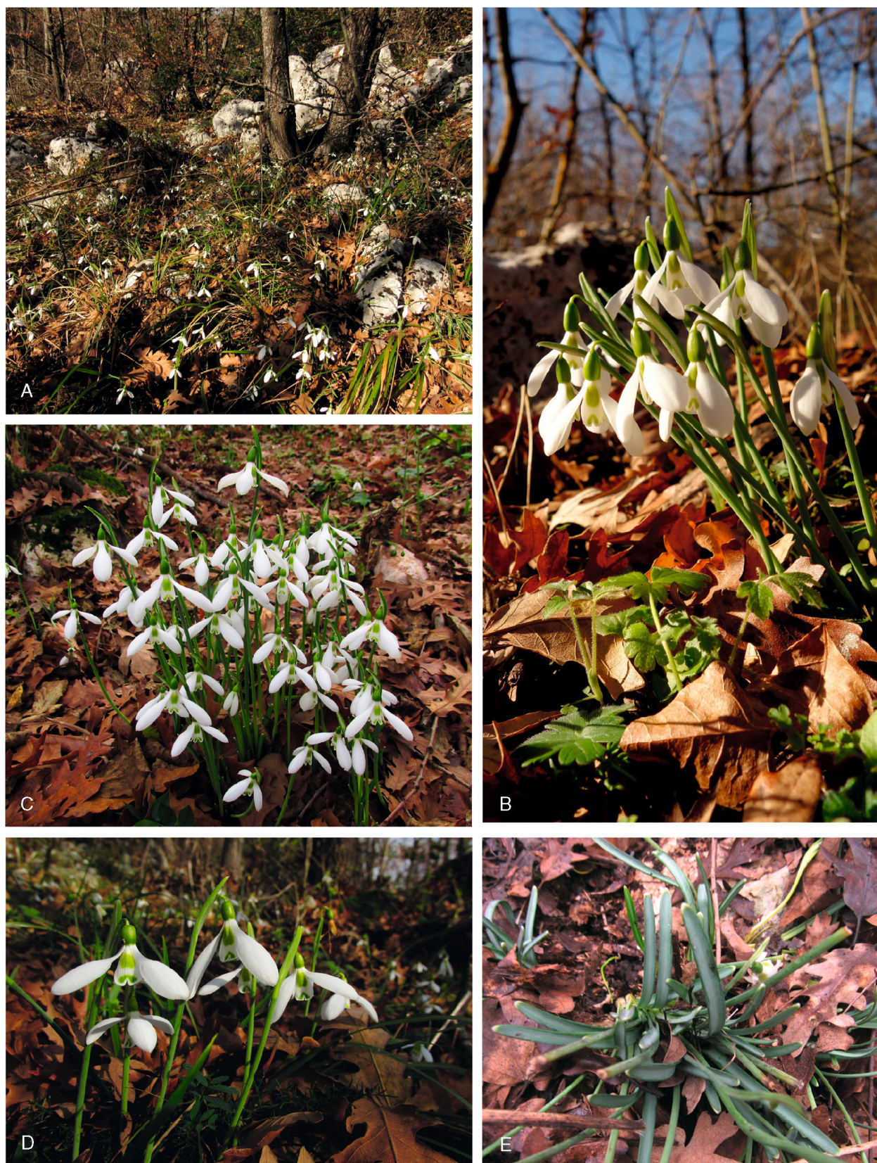
Fig. 2. Images of Galanthus bursanus in situ. A habitat, at red soil pockets developed in limestone outcrops under Quercus cerris forest; B, C habitat at locus classicus ; D flowers; E leaves at fruiting stage. All photos taken at the locus classicus (A, B 26 Nov. 2016; C, D 25 Nov. 2018; E 11 Feb. 2017).