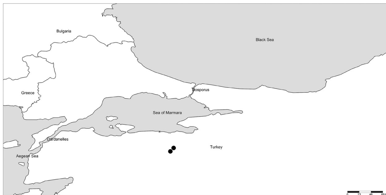
Map 1. Distribution of Galanthus bursanus based on collection localities.