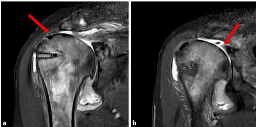
Fig. 2 ▲ Total allograft patch rupture: a rupture located on glenoidal side (arrow), b rupture located on humeral side (arrow)

SCR using a human dermal allograft are presented in Table 1 . Arthroscopic surgery prior to SCR included failed supraspinatus tendon reconstructions, latissimus dorsi transfer, debridement and long head of biceps tenotomy. No significant differences regarding demographic data were detected between patients with and without pseudoparalytic conditions ( Table 1 ). Tendon tears involving the musculus supraspinatus, infraspinatus, or subscapularis were detected and reported if reconstruction was needed. Preoperative radiographic evaluation according to the Hamada classification showed eight patients with Hamada Grade 1 and 13 shoulders with Hamada Grade 2. No significant difference in outcome or complications was detected.