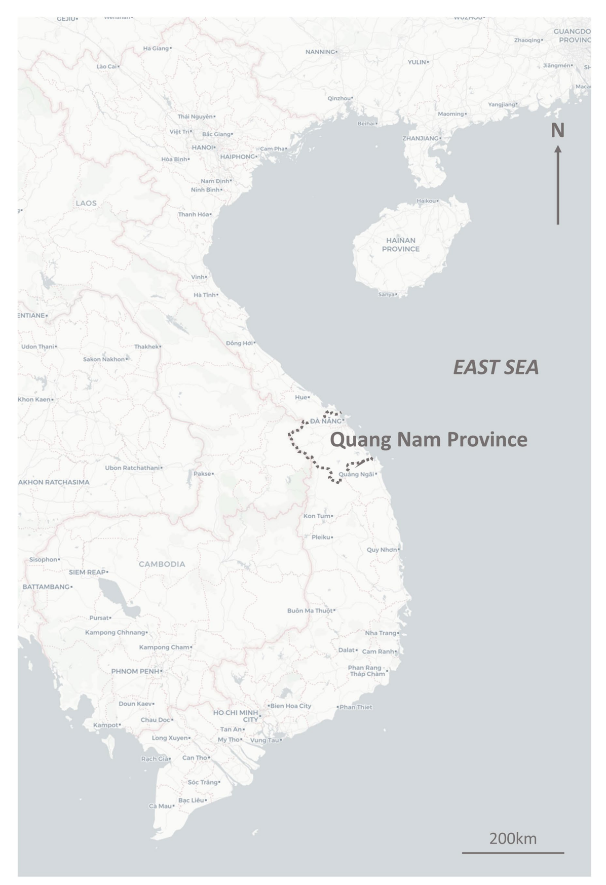
Fig. 1 Location of Quang Nam Province in Vietnam