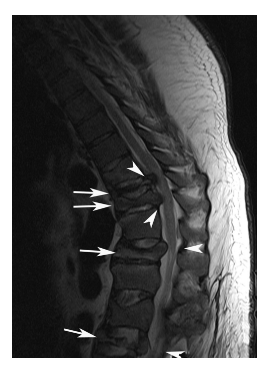
Figure 1. MRI showing multiple compression fractures (arrows) along with narrowing of the spinal canal (arrowheads).

J Gen Intern Med 30(3):373 DOI: 10.1007/s11606-014-3088-2 © Society of General Internal Medicine 2014