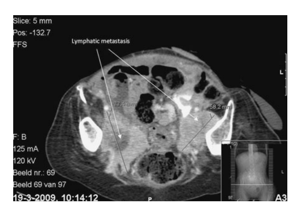
Fig. 2 Computed tomography–intravenous pyelography (CT–IVP) at the time of metastasis. Two lymph node metastases (77.4 and 58.2 mm) in the small pelvis are clearly visible

The tumour measured 10 centimetres with a maximal infiltration depth of 1.8 centimetres and was removed radically. One of the para-iliac lymph nodes contained a metastasis of the bladder tumour. Eventually, the TNM tumour stadium was T3N1M0 (TNM Classification 2002), grade III (WHO 1973), with sarcomatoid differentiation. Three months later, at CT abdomen, large bilateral lymph node masses were detected, very suggestive for metastasis (Fig. 2). Also, infiltration to the sigmoid colon was seen, as infiltration to the iliac veins. She was referred to medical oncology but found to be unfit for systemic chemotherapy because of a body weight of 36 kilograms and a poor nutritional status. She was a candidate for undergoing stenting of the iliac veins, since pain and oedema developed in the lower extremities due to venous drainage obstruction in the small pelvis. However, this was eventually not done because she developed urosepsis at the day of operation. Constipation developed because of a mass effect of the metastases on the sigmoid colon. The consulting surgeon decided to treat this conservatively. She was referred to a hospice with no further therapy than adequate analgesia and comforting and died in June 2009 at the age of 32 years, about 8 months after diagnosis.