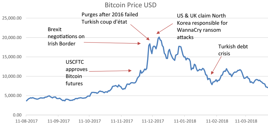
Fig. 1 Annotated events, December 2017—January 2018 Bitcoin rally

fundamental changes, and propose an objective decision support set of criteria. This evaluation of features seems to be important when predicting the chosen features of new coins in the market, and furthermore what features the most successful coins of the future might possess (Chatterjee et al. 2018). This leads us to propose the following research questions: