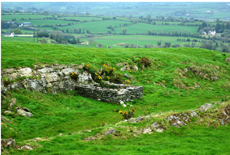
Plate 11 Wall Surrounding Gortnamuckla Mass Rock

The final class of Mass Rock is that which has been deliberately constructed, usually out of locally available stone. Man-Made Stone Built Mass Rocks can be built into or onto an existing natural landscape feature such as a cliff face or rock outcrop, as occurs at the Beach Mass Rock (Plate 5). Alternatively, they can stand alone as an independent feature