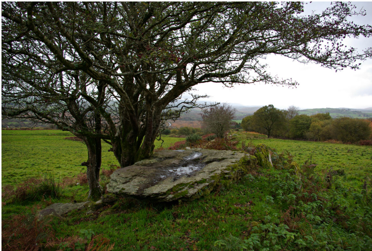
Plate 2 Cooldaniel Mass Rock

their ancestors intimately and nurtured a potent belief in ‘the spiritual world and ‘older’ faiths’ (Smyth 2006, p.61).