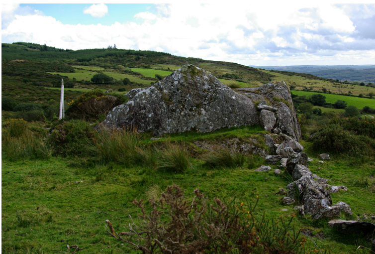
Plate 9 Gortnahoughtee Mass Rock