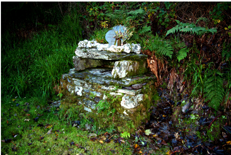
Plate 7 Curraheen Mass Rock

A number of trees are recorded throughout the history of religions, including trees of life, immortality and knowledge. Such trees have ‘come to express everything that