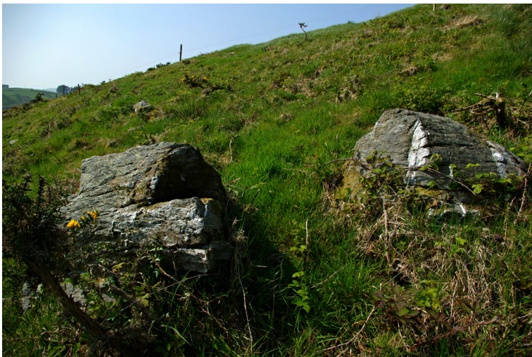
Plate 1 Cullomane West Mass Rock