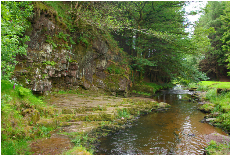
Plate 4 Glenville Mass Rock Beside River Bride

Ross and Bealnamorrive and Curraghrour East in the diocese of Cloyne. In addition to the house-hold based ‘stations’ which were themselves a response to the restrictions of the Penal laws and chapel-based activities, the practice of visiting Holy wells was one of the main expressions of Catholic devotion in pre-Famine Ireland (Giolláin 2005, p.35–40 cited in O’Sullivan and Downey 2006, p.35). In Analeen townland, the Holy well of St John the Baptist was itself used as a place for open air Mass in Penal days (site notice).