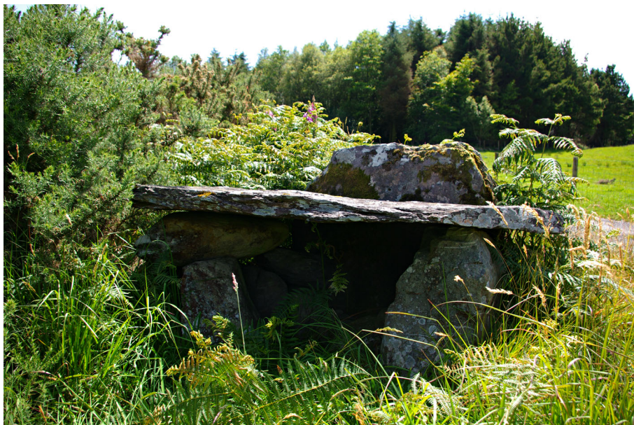
Plate 3 Derrynafinchin Mass Rock