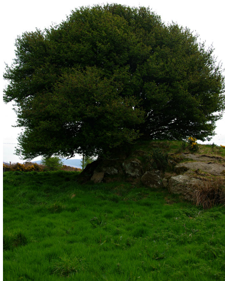
Plate 8 Ardrah Mass Rock

Trees and woodlands remained integral elements of Irish culture up to the mid-seventeenth century. From this point onwards, aggressive English expansion resulted in a transformation of the Irish landscape, denuding it of its trees and forests so that they became simply 'a memory and a metaphor for the Irish' (Smyth 2006, p.88). By 1720/1730 the woodland culture that had existed for centuries in Ireland had been shattered (Smyth 2006, p.102) but, despite this, folklore repeatedly speaks of sacred trees and bushes where Mass was often celebrated during Penal times. In Garrda na Sgeac ,