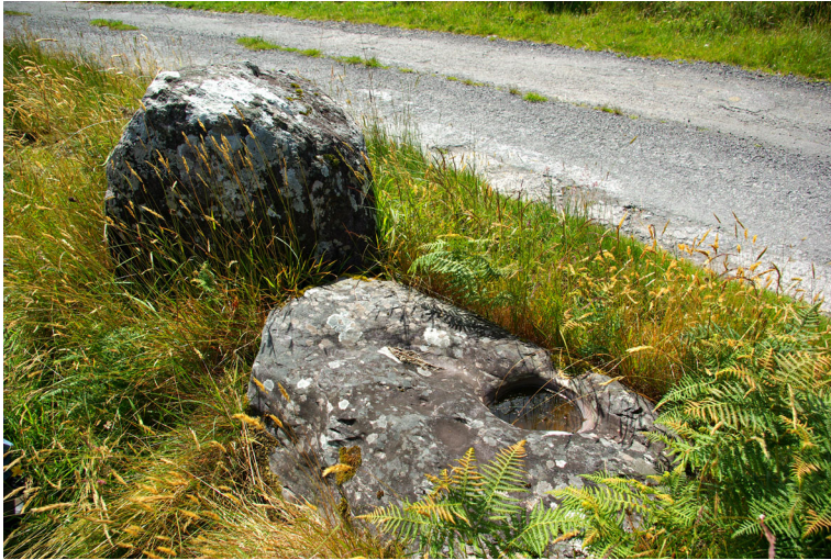
Plate 10 Bullaun stone at Derrynafinchin Mass Rock Site

using a rowing boat. It was also celebrated in an underground cave in Shanbally (NFCS 1937w, 390, and p.137). In Ardglass there is an underground site known as the Mass Cave where an iron cross was discovered buried in the rock (NFCS 1937p, 367, p.434).