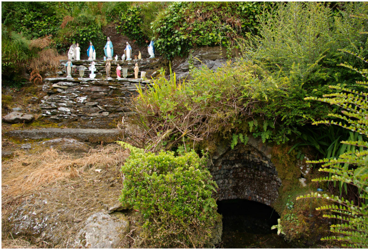
Plate 5 Beach Mass Rock and Lady's Well