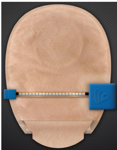
Fig. 1 Example of the Ostom-I sensor in situ clipped onto a stoma bag