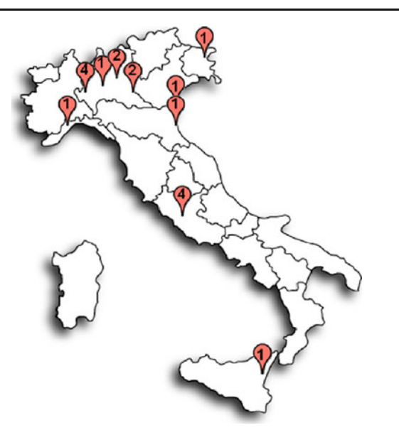
Fig. 1 Geographical distribution of the community-acquired methicillin-resistant Staphylococcus aureus (CA-MRSA) cases. The numbers within each placemarker represent the number of cases