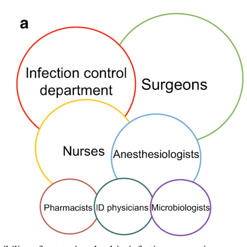
Fig. 1 Responsibility of actors involved in infection prevention versus treatment. Circle size is proportional to role importance in prevention or treatment.a Surgeons, infection-control physicians, nurses and anaesthesiologists play an important role in infection prevention. The role of pharmacists, infectious disease (ID) physicians and

Wound drainage Wound drains have been used to prevent fluid accumulation, and some debate remains on the difference between using and not using drains [124]. Several studies in the orthopaedic domain indicate that there is no advantage