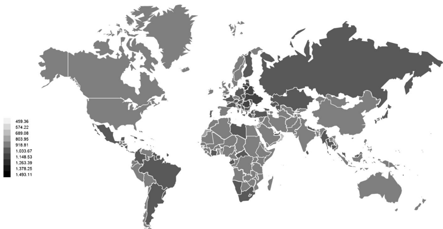
Fig. 1 Choropleth map of the female to male sex ratio in 2013

Table 2, column 4, presents estimates of the coefficients of the baseline version of Eq. (1) expanded to accommodate a host of controls. The theses of Alesina et al. (2013)