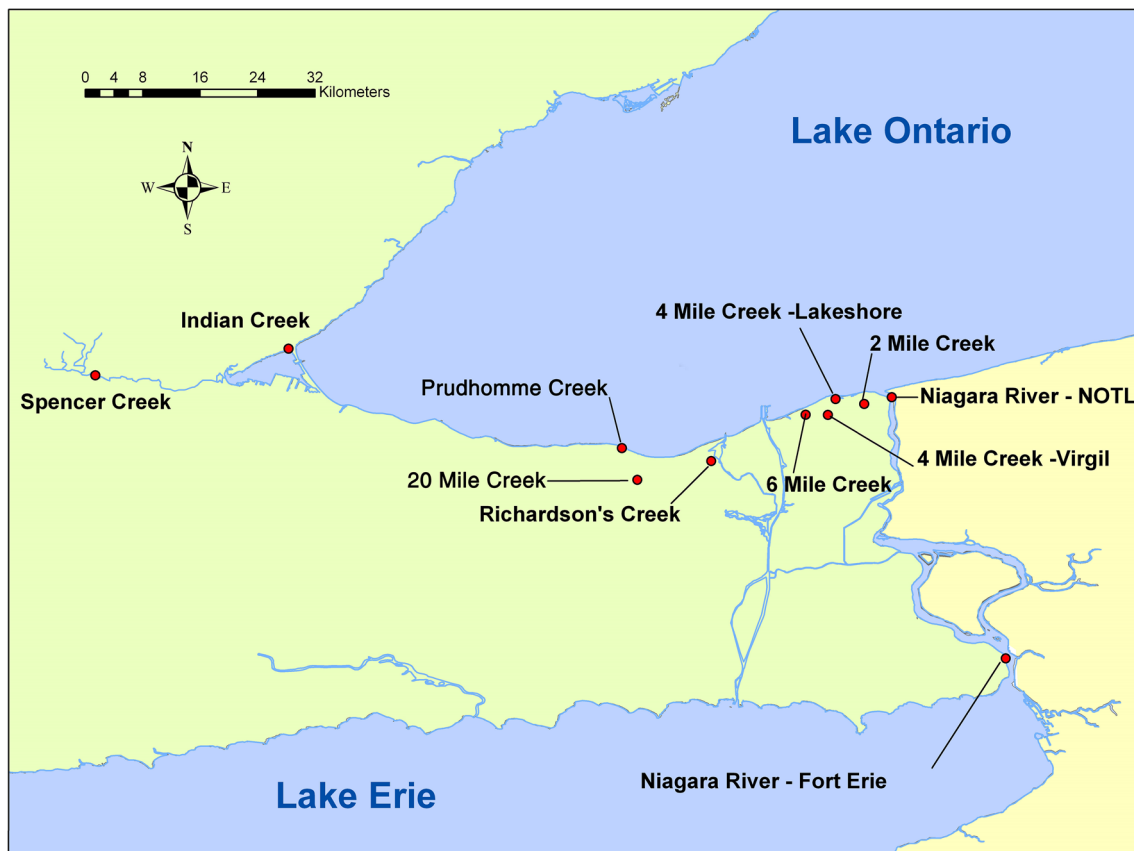
Fig. 1 Locations of the sampling sites in southern Ontario ( NOTL Niagara-on-the-Lake). Note The two sampling locations for 2 Mile Creek were represented by one location

range of crops, was included in the analytical method. While technical registration of both carbofuran and pirimicarb in Canada has expired, both products were used during some of the monitoring period (2007–2010), and as of the end of 2013 were still on the residue definitions list under the Canadian Pest Control Products Act and monitored by Provincial and Federal agencies (Health Canada 2013).