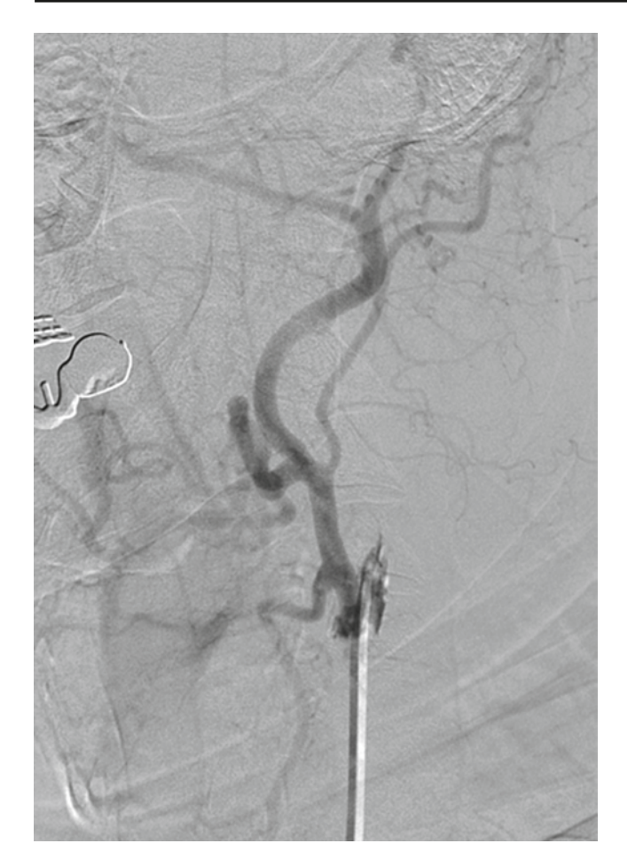
Fig. 1 Catheter angiography (DSA) demonstrates complete occlusion of the left internal carotid artery

teral ICA occlusion (Fig. 1) and revealed collateralisations via the ophthalmic arteries as well as via vertebro-basilar pathways. Importantly, origin and subsequent course of the left external carotid artery (EC) were found to be entirely normal and an EC–IC bypass was considered accordingly.