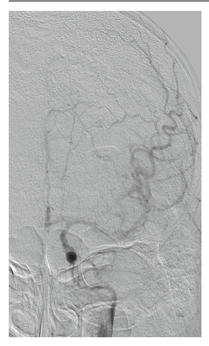
Fig. 4 The post-interventional DSA image in frontal view shows the filling of the ipsilateral MCA (image quality is considerably diminished as the patient was only minimally sedated for the procedure and became progressively agitated)

regional perfusion with consequent hemodynamically distributed infarcts. While the value of thrombolysis and fibrinolysis in the acute setting has been shown to be beneficial [14], the mechanism underlying the acute deterioration in our case was rather due to hypoperfusion rather than thromboembolism. EC–IC bypass has been reported in a selected group of patients with poor reserve capacity when CEA was not possible [6]. In our case, EC–IC bypass appeared appropriate but was not applicable because of the acuteness of the patient's deterioration. Paty et al. [15] reported on success rates of CEA of the order of 30 % when performed within 14 days after the onset of symptoms. Furthermore, successful CAS [16] and stent-assisted revascularisation of intracranial vessels [17] in a subacute stage had been reported.