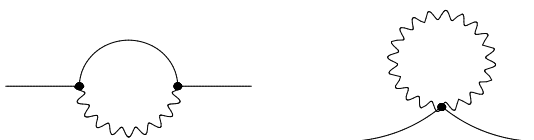
Figure 1. The superdiagrams giving the two-point Green function of the matter superfields in the one-loop approximation.

part of the effective action corresponding to this Green function can be written in terms of the renormalized quantities as