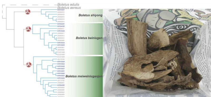
Phylogeny of three new species discovered in a packet of dried “porcini” in relation to Boletus edulis (right).

named by fast-track publishing through Index Fungorum as B. bainiugan , B. meiweiniuganjun , and B. shiyong on 12 October 2013 2 . The molecular analyses that form the basis for those decisions are, however, presented in the paper commented on here, but the macroscopic features await documentation by fresh collections from China.