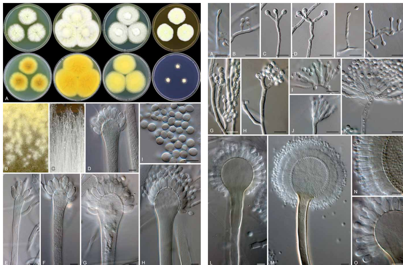
Plates courtesy of Robert A. Samson.

1 http://asperweb.co.uk/content/aspergillus-taxonomy-poll .