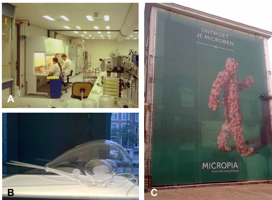
A. The Micropia laboratory. B. One of the beautiful glass models of microbes on display. C. "Ontmoet je microben" ("Meet your microbes").

playing an advisory role as well as delivering fungal cultures.