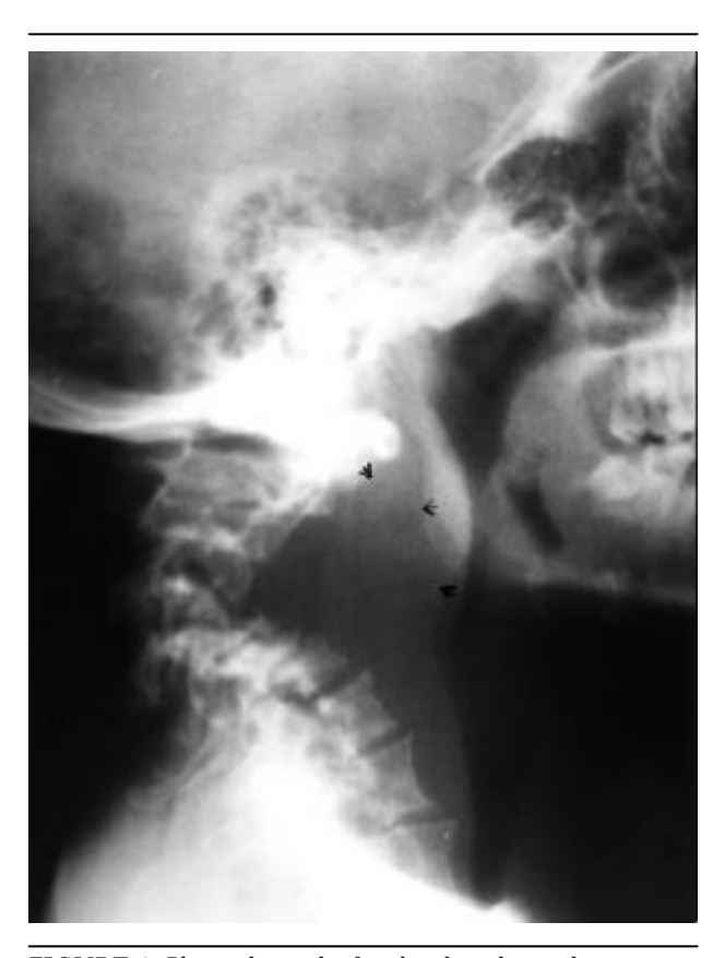
FIGURE 1 Plain radiograph of neck in lateral view showing extreme Kyphosis.

Space occupying lesions in the retropharyngeal space are rare. Various masses have been described including angiomyoma, <sup>1</sup> ganglioneuroma, <sup>2</sup> malignant mesenchymoma, <sup>3</sup> neuroblastoma <sup>4</sup>: the commonest are hematomas. <sup>5</sup> The clinical presentation is varied but most had presenting symptoms of dyspnea and dysphagia. In this 27-yr-old patient the retropharyngeal neurofibroma presented with severe cervical kyphoscoliosis (Figures 1,2) and neurological symptoms of tingling and numbness in both arms but there were no