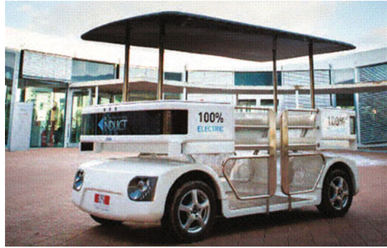
Fig. 14.2 Open design of the Induct Navia [2]

the vehicle immediately using an emergency switch. In such instances, the vehicle occupants can also contact operating personnel using a vehicle communication system in order to request help or to communicate other concerns. Because the connection is radio-based, the operating personnel can be situated at a location completely independent of the operating area.