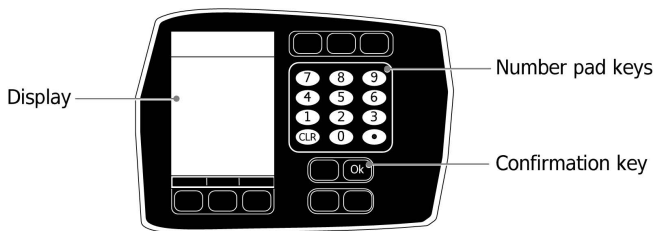
Fig. 2. Layout of the infusion pump user interface under study

we had access to the source code of the user interface software, but we did not have access to the design documentation of the pump, nor the library objects its implementation referenced. Admittedly, the absence of library code may cause inaccuracy of verification (e.g., design issues are falsely detected or omitted). Fortunately, the design issues detected in this study, as reported in section 2, were confirmed as genuine and caused by the subject implementation.