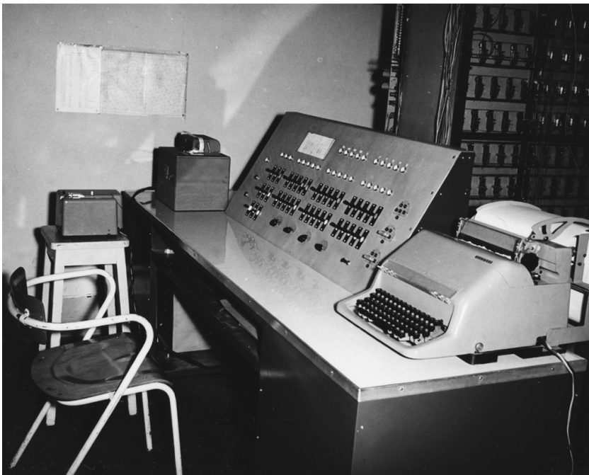
Fig. 1. The only surviving photo of the Manual Control Panel of the 1957 MR

A detailed discussion of the problems faced by HMR in the rebuilding of the MR is in [7], while in [17] the use of the simulator of the 1956 MR for the “restoration” of its system software is presented. In the following we focus on the use of the 1957 MR simulator in the teaching workshops held at the Museum. The virtual MR is used to revive the look and feel of an old computer and to show and discuss some of the principles and mechanisms according to which past and present computers work.