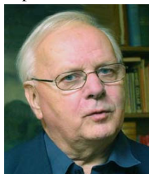
Kristen Nygaard in the mid-1990s

Many people are characterized as great. What constitutes great people? There is no simple answer. How do you measure greatness? Was Professor Kristen Nygaard (1926-2002) a great man? Maybe not, but in our view Nygaard set a high standard against which you can measure other people's greatness.