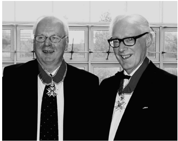
Kristen Nygaard and Ole-Johan Dahl in 2000, proud receivers of recognition from the King of Norway

The major chords of Nygaard's life's work are solidarity and empowerment. In his work on computer languages, system development, and object-oriented education, as well as in his work for the homeless, the trade unions, the environment, and the "Nei til EU" movement, he took the side of the common people against the forces of the market. He recognized that the means a person uses to structure his thinking about a phenomenon and his understanding of the world is not neutral. Information technology, he maintained, reflected by and