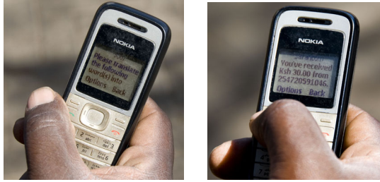
Fig. 1. There are particular words or phrases that are necessary to adequately localize software, such as the interface of a mobile phone. The photos above shows a phone receiving a translation task targeted at users who speak Giriama, the local language of coastal Kenya and the user being compensated after the successful completion of a set of translation tasks.

Surveys & Market Research. Conducting large demographic surveys in remote areas of the developing world is a challenging and costly endeavor. However in countries such as Kenya, where even the most isolated areas generally have GSM reception, it becomes possible to remotely administer surveys using text messaging. Phone-based surveys are an efficient and economical method of collecting a wide variety of information including market research, census, health, activity, and commerce data. While there is no ‘correct’ answer when assessing personal opinions, we are also asking users to estimate what the opinion is of the average person in her area. With enough respondents in the area, we will learn if these responses converge.