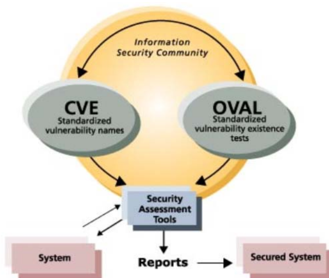
Fig. 1. Operational Procedures of OVAL

security community. CVE common names make it easier to share data across separate network security databases and tools that are CVE-compatible. CVE also provides a baseline for evaluating the coverage of an organization's security tools, including the security advisories it receives. For each CVE name, there are one or more OVAL queries. Fig.1 shows the operational procedure of the assessment tool based on OVAL.