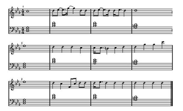
Fig. 2. Example of generated music