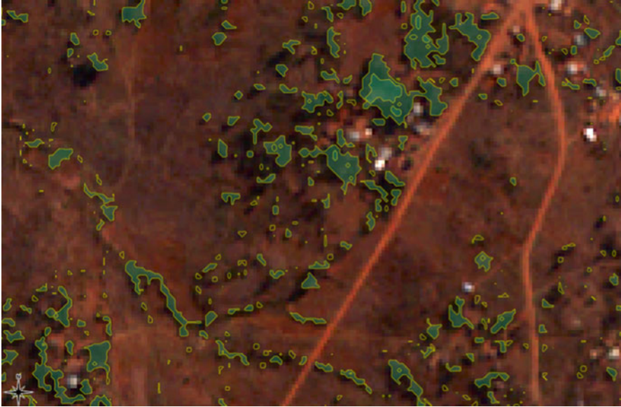
Fig. 6.2 Delineation of TOF crowns by remote sensing using sub-meter resolution Quickbird imagery (Gumbrecht unpublished)

resolution, it is not possible to identify trees and may lead to underestimation of biomass. Unfortunately, the price of the satellite imagery increases in parallel with the resolution and the specialized skills necessary to process the imagery limits many applications of this technique outside of the research arena at this time. Despite the challenges, crown area allometry is likely the most promising approach to transform our ability to capture information on aboveground biomass stocks, potentially for relatively low total costs in the future (Gibbs et al. 2007; Wulder et al. 2008).