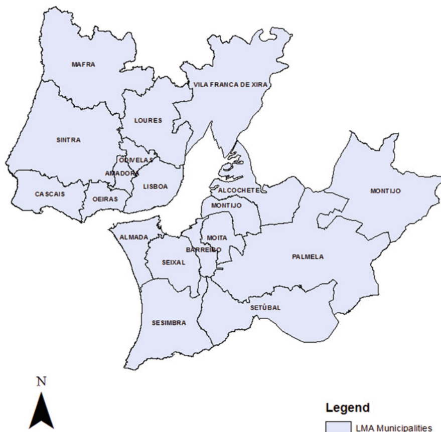
Fig. 7.1 Lisbon Metropolitan Area (LMA)

the 1960', with flows coming essentially from rural areas, the immigration dynamic of the 1970s and the 1980s is mainly related to the population of the ex-Portuguese colonies, which occupied the first peripheral crown of Lisbon. According to a recent characterisation of LMA with planning purposes (Regional Coordination Commission of Lisbon and Tagus Valley [CCDR]), this is a polarised territorial entity with an influence that exceeds its administrative borders, explained by, and among other factors, the improvement of transport infrastructures (CCDR 2009: 33). LMA is the location of multinational enterprises and several industrial activities, especially in the South bank of Tagus River. It is the most competitive economic center of the country (38.6% of National GDP) (CML 2012) with global integration and a strong presence in international markets. This is also a territory with problems like the lack of land use planning, urban and landscape disqualification, mobility, environmental risks, social exclusion and inequality (Figs. 7.2 and 7.3).