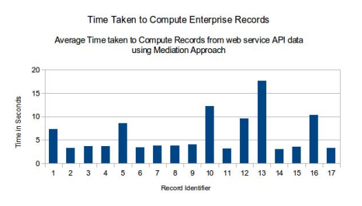
Fig. 3. DaWeS: Record Computation Time

Figure 3 shows the time taken to compute the records using the WS API operations serially. The spikes point the situations when data is not available locally in the cache and the API operations have to be made. Use of cache and the proposed heuristics helped us to reduce the number of API operation calls, without which it takes too much time (many hours at least). Currently we are working on the precise semantics of the