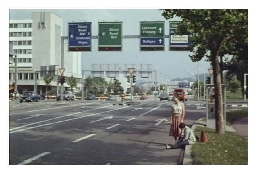
Fig. 2.5 Messidor: The road forms a social border difficult to cross for Jeanne and Marie

quo. The sudden heavy sound of traffic interrupts the silence of the mountains and situates the two hitchhiking women on the side of a busy road (see Fig. 2.5). The dissonant score in a minor key and the long take of the two small bodies framed in a long shot immobile on the side of the road—in opposition to the movement of the cars in the centre of the frame—produce a sense of entrapment, an entrapment into a sexist system, which the urban space embodies and from which it is difficult to escape. Whereas the road forms a visual border on screen, maintaining the women in stasis and on the margins of the public sphere, the mountains become their home on the road, a 'room for themselves'. As we will see in the following chapters, affirmation of wilful women often coincides with establishing and inhabiting one's own space, which manifest both diegetically and aesthetically.