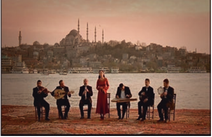
Fig. 5.1 Head-On: Chanting tableaux opening and closing the film