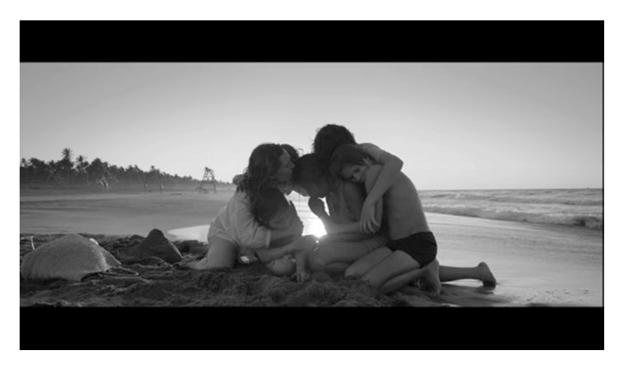
Fig. 6.1 Roma: The family surrounding Cleo as a member of the family