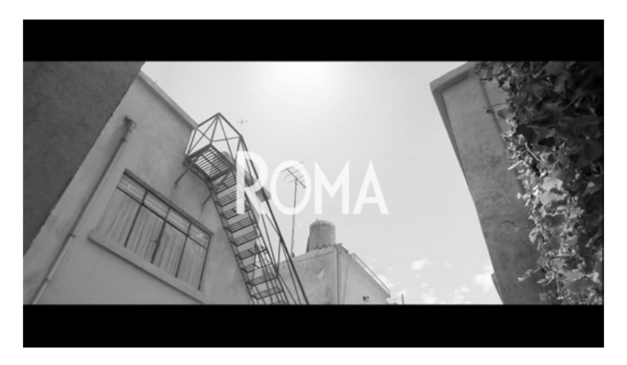
Fig. 6.2 Roma: Ending image after Cleo has left the frame