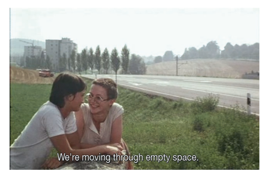
Fig. 2.6 Messidor: 'We're moving through empty space'

lack of frequent action, and numerous ellipses emphasise the long-lasting persistence of the protagonists against the power-geometries they have to face. Scenes often start in medias res (such as in Homer's The Odyssey): in the middle of conversations, with a response to an unheard question, or by framing a landscape in a fixed shot that the moving bodies of the protagonists interrupt. The lack of chronology and cartography of the women's journey creates a sense of affective duration, not limited by time and space but expandable across times and spaces through how one is affected and affects others. The wilful affects of the protagonists are demonstrated on screen as disobedience, going against the flow, and occupying space. When Jeanne and Marie walk on the side of the road, the camera films them in tracking shots from right to left, walking against the traffic that flows in a conventionally forward direction from left to right on the screen. As they philosophically reflect on their own movement 'in empty space... [becoming] interesting', their paused bodies and their voices take the foreground while the passing cars and the sounds of traffic are relegated to the background (see Fig. 2.6). Their bodies taking space on screen give form to wilful affects, as a refusal to go with the flow of the patriarchal capitalist system. The aesthetic choices of this scene show how their paused