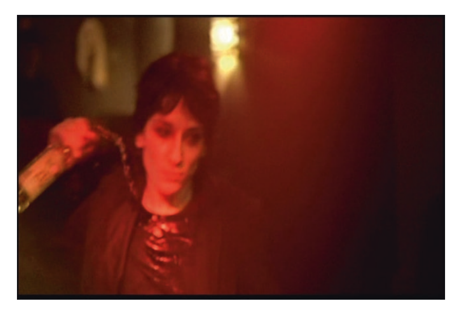
Fig. 5.7 Head-On: Sibel drinks and dances until she falls to the ground, unconscious

In the third dancing sequence that closes Sibel's punk life, she drinks and dances frantically in a bar in Istanbul to the point of collapse. While Sibel drinks and dances, the song 'I Feel You' by Depeche Mode plays, loudly and extra-diegetically, indicating Sibel's own self-destructiveness and anticipating the ultimate trajectory of her life ('I Feel You' also plays when Cahit drives his car into a wall at the beginning of the film). The lyrics of the song correlate with the diegesis of the film, in its suggested replacement of religion (the Muslim religion of Sibel's family) with sex and drugs ('you take me to and lead me through oblivion'). As Sibel drinks and whirls around, the handheld camera follows her movement in close-up, making a constant effort to reframe her in the middle, and even 'loses' her for a moment. The editing of the scene, through multiple cuts and dissolves of short takes of Sibel in close-up, condense the passing time while giving form to Sibel's wilful liminal subject. If the camera's framing of Sibel obeys the cinematic narrative conventions of keeping the main character in the frame—filmically integral to social norms—the disjointed editing gives shape to a resistance to integrate a normative frame of