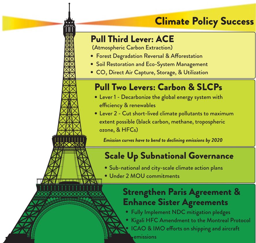
Fig. 25.1 Four building blocks to achieve climate policy success. HFC hydrofluorocarbon, MOU memorandum of understanding, NDC nationally determined contribution, SLCPs short-lived climate pollutants

The climate has already warmed by 1 °C (IPCC, 2013). The problem is running ahead of us, and under current trends we will likely reach 1.5 °C in less than 15 years (Xu and Ramanathan 2017) and surpass the 2 °C guardrail by midcentury with a 50% probability of reaching 4 °C by the end of the century (IPCC, 2014b; Ramanathan & Feng, 2008; World Bank, 2013). Warming in excess of 3 °C is likely to be a global catastrophe for three major reasons: