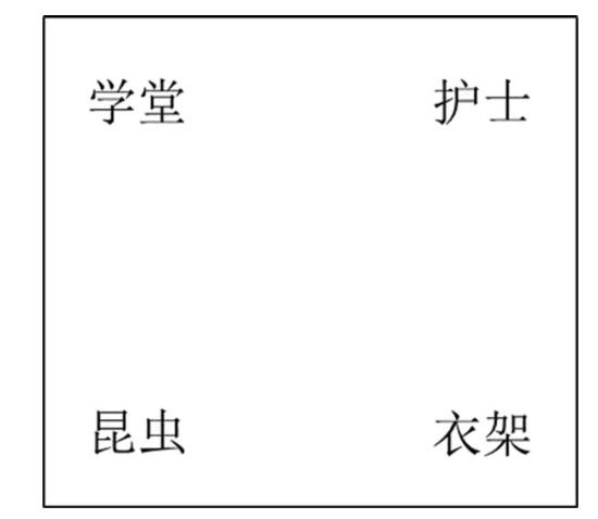
Fig. 1 An example of a printed-word display used in the present study. For a spoken sentence like "在利比里亚人们常把 医生 叫做天使" ("In Liberia, people often call doctors angels"), the printed-word display could consist of a semantic competitor word 护士 (hu4shi4, "nurse"), a phonological competitor word 衣架 (yi1jia4, "hanger"), and two unrelated distractors 学堂 (xue2tang2, "school") and 昆虫 (kun1chong2, "insect") in four different positions on the display