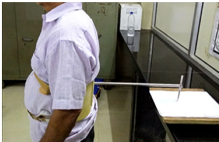
Fig. 2 Measuring postural sway using a sway meter

The footprint method was used to assess the step length. The participants were made to sit on a chair after which their feet were damped and later dipped in a colored chalk powder and were instructed to walk on the walkway made from a long white sheet of paper at a self-selected pace (Fig. 4). An average of 5 steps was taken for both sides. The step length (cm) was measured from the geometrical heel center of the current footprint