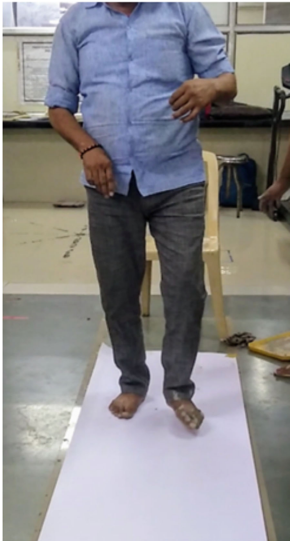
Fig. 4 Measuring step length using the foot print method