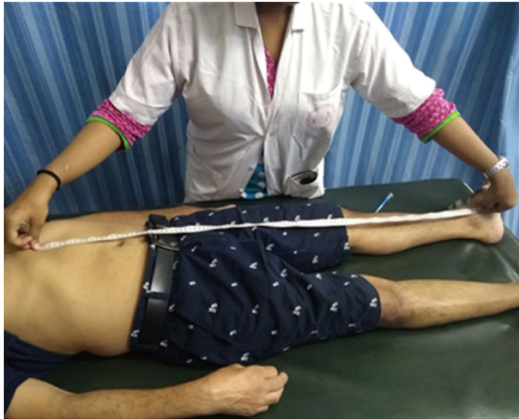
Fig. 1 Measurement of apparent LLD

condition, good to excellent reliability was seen in following directions: ICC of 0.748 (posterior), ICC of 0.887 (left lateral), and ICC of 0.913 (right lateral) except in the anterior ICC of 0.462.